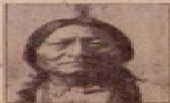
Chief Sitting Bull